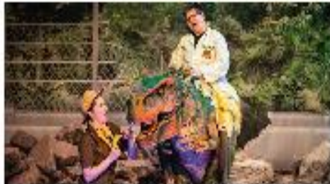
Dinosaur Adventure Live! A roarsome family show Sat 26 Oct, 11:30am & 2pm