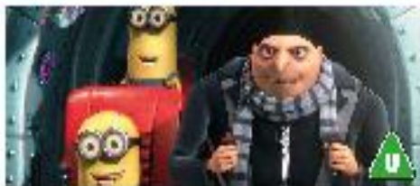
Saturday Morning Pictures Despicable Me 4 Sat 26 Oct, 10:15am