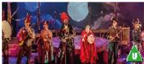
Royal Ballet & Opera Wolf Witch Giant Fairy Sat 26 Oct, 3:30pm & Tue 29 Oct 1:30pm