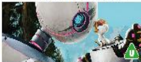
Autism Friendly Screening The Wild Robot Sun 3 Nov, 10am (plus standard screenings from Fri 28th Oct)