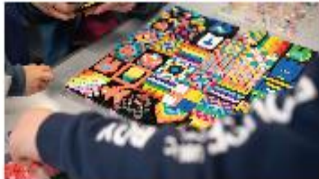
The Brick People If you love LEGO® you'll love this! Sun 3 Nov, 9:30am, 10:45am, 12pm, 1:30pm & 2:45pm