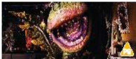
One for the teens The Little Shop of Horrors Thu 31 Oct, 8:30pm