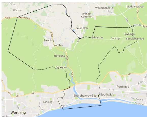
Adur Valley Parish