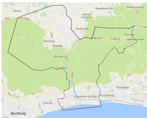
Adur Valley Parish