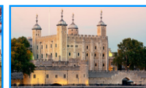
Tower of London