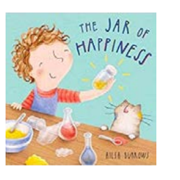
The Jar of Happiness