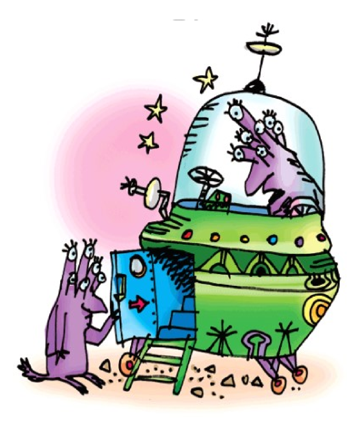
shut the d<u>oor</u>

2. d<u>oor, poor, moor, floor, poor</u>ly, ind<u>oor</u>s, d<u>oor</u>way, m<u>oor</u>hens