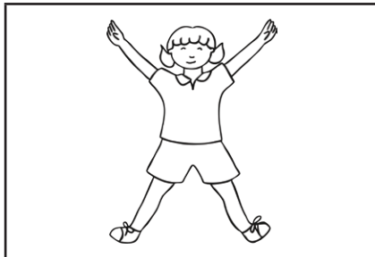
one star jump