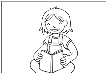
reading a book