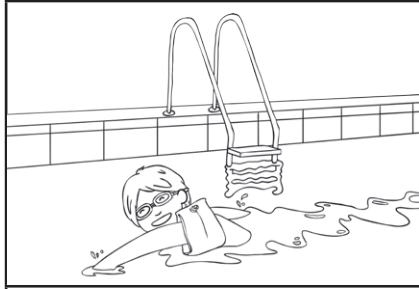
a swimming lesson