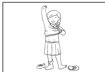
getting dressed for school