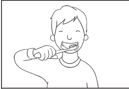
brushing your teeth