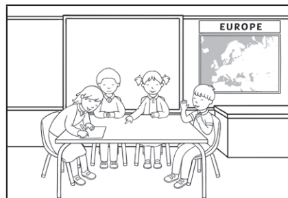
a day at school